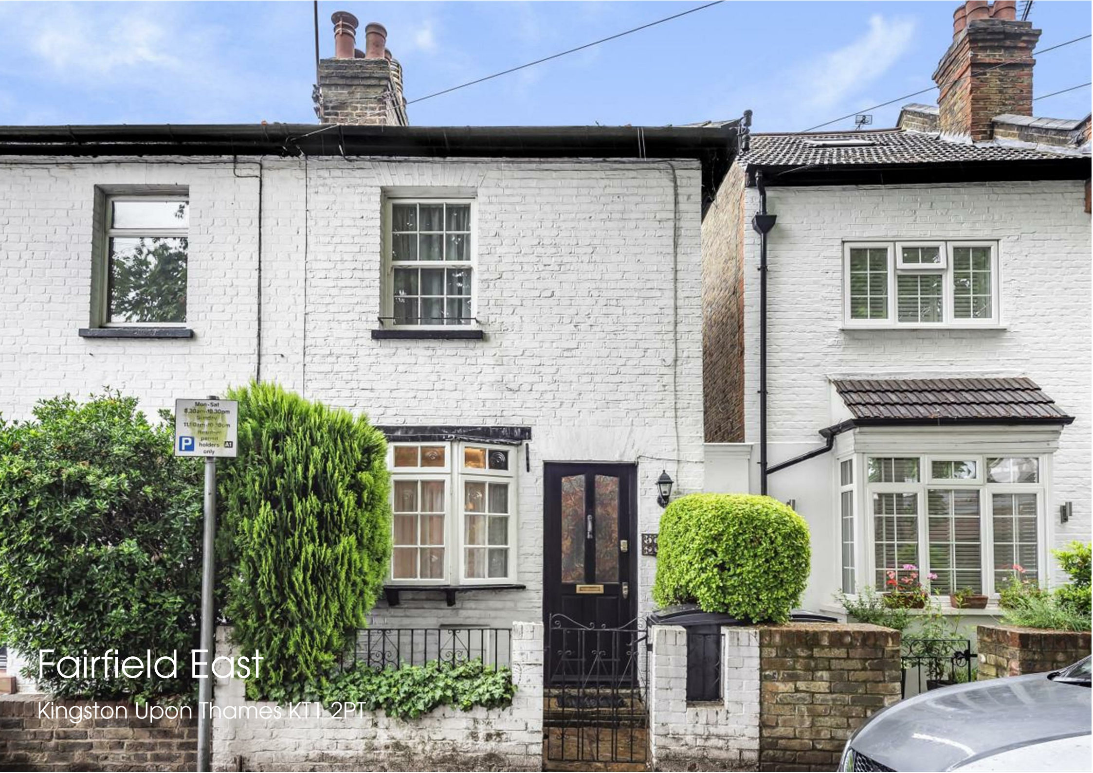
Fairfield East Kingston Upon Thames KT1 2PT